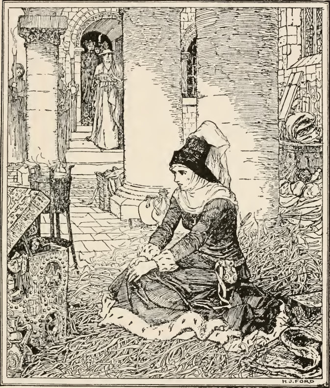
"Desolate and dismayed."

man,' had quietly fallen asleep in a corner on a heap of wall-hangings that happened to have been set down there. So it was that the archbishop and lord chancellor, who